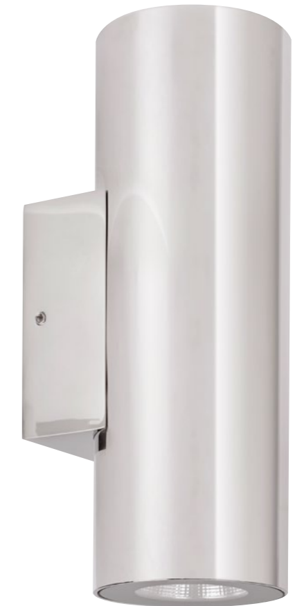
Polished 316 Stainless Steel