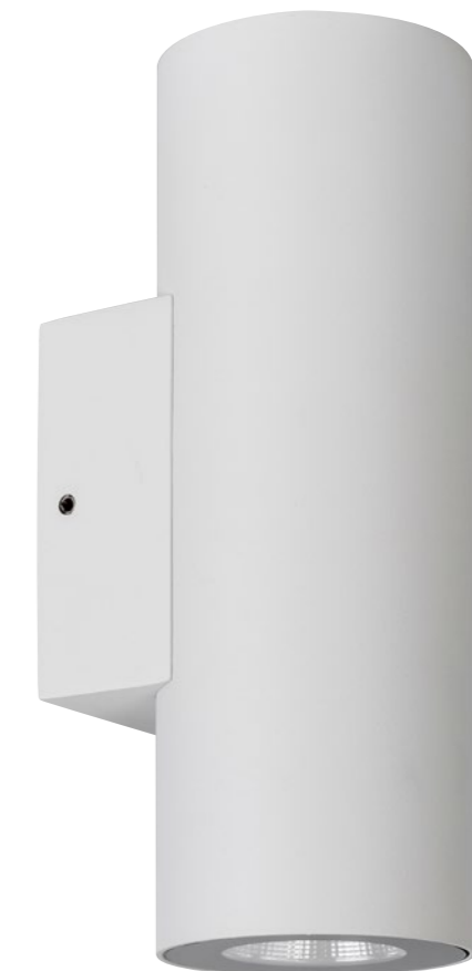
316 Stainless Steel White