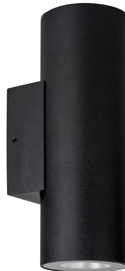
316 Stainless Steel Black