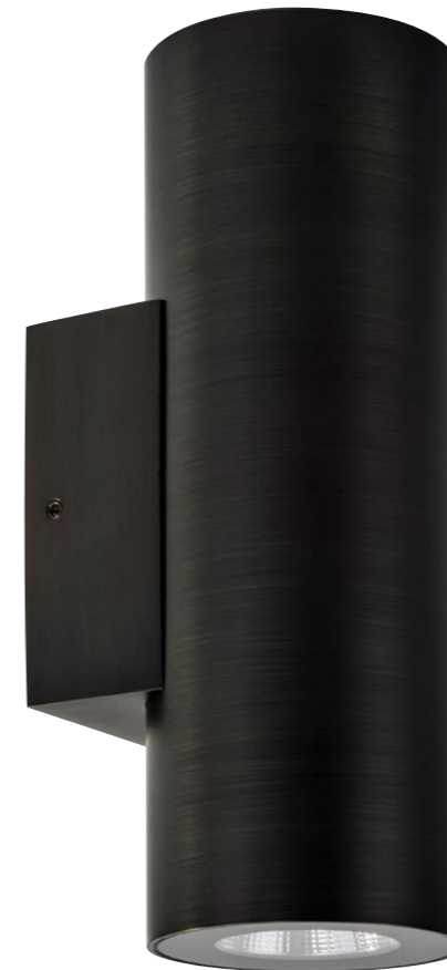
316 Stainless Steel with Antique Brass Finish