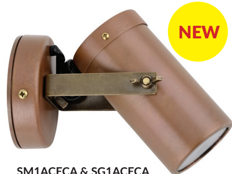
SM1ACECA & SG1ACECA