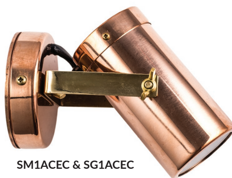
SM1ACEC & SG1ACEC