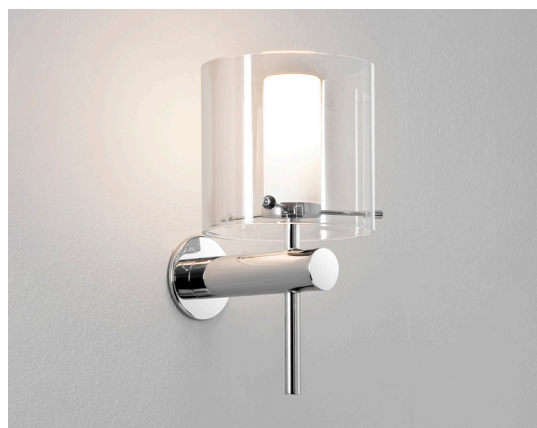
CODE: 1049001 FINISH: POLISHED CHROME

To maintain this product to its best condition, please view our care and cleaning guide on the support section of the astro website.