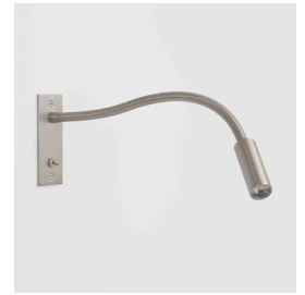
CODE: 1295002 FINISH: MATT NICKEL