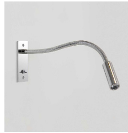
CODE: 1295001 FINISH: POLISHED CHROME