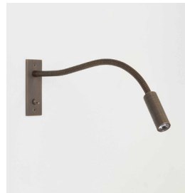
CODE: 1295003 FINISH: BRONZE

TO MAINTAIN THIS PRODUCT TO ITS BEST CONDITION, PLEASE VIEW OUR CARE AND CLEANING GUIDE ON THE SUPPORT SECTION OF THE ASTRO WEBSITE.