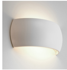
CODE: 1299001 FINISH: CERAMIC