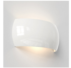
CODE: 1299009 FINISH: GLOSS GLAZE WHITE

TO MAINTAIN THIS PRODUCT TO ITS BEST CONDITION, PLEASE VIEW OUR CARE AND CLEANING GUIDE ON THE SUPPORT SECTION OF THE ASTRO WEBSITE.