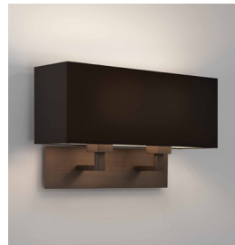
CODE: 1080021 FINISH: BRONZE

TO MAINTAIN THIS PRODUCT TO ITS BEST CONDITION, PLEASE VIEW OUR CARE AND CLEANING GUIDE ON THE SUPPORT SECTION OF THE ASTRO WEBSITE.