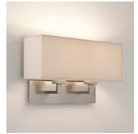
CODE: 1080020 FINISH: MATT NICKEL