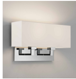
CODE: 1080019 FINISH: POLISHED CHROME