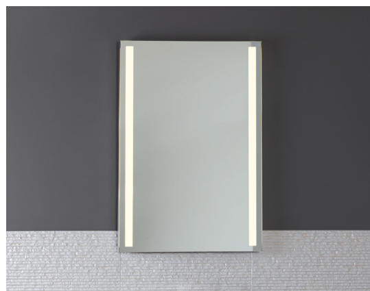
CODE: 1359017 FINISH: MIRROR

TO MAINTAIN THIS PRODUCT TO ITS BEST CONDITION, PLEASE VIEW OUR CARE AND CLEANING GUIDE ON THE SUPPORT SECTION OF THE ASTRO WEBSITE.