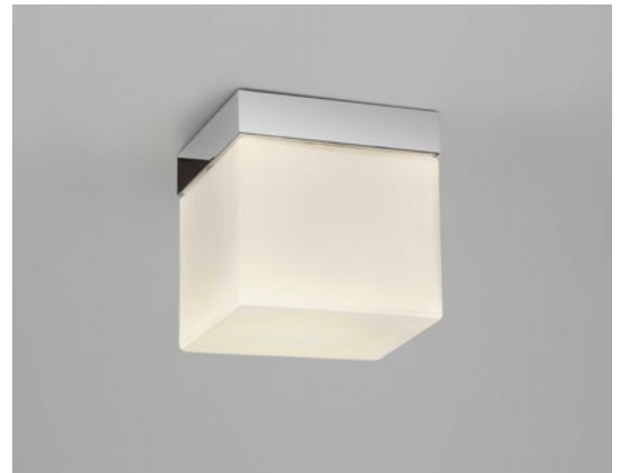
CODE: 1292002 FINISH: POLISHED CHROME

TO MAINTAIN THIS PRODUCT TO ITS BEST CONDITION, PLEASE VIEW OUR CARE AND CLEANING GUIDE ON THE SUPPORT SECTION OF THE ASTRO WEBSITE.