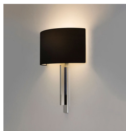
CODE: 1334002 (7254) FINISH: POLISHED CHROME