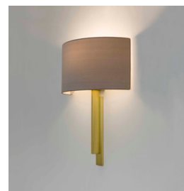
CODE: 1334003 (7255) FINISH: MATT GOLD