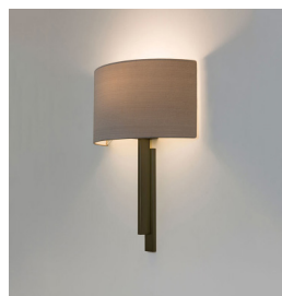
CODE: 1334007 (8246) FINISH: BRONZE

TO MAINTAIN THIS PRODUCT TO ITS BEST CONDITION, PLEASE VIEW OUR CARE AND CLEANING GUIDE ON THE SUPPORT SECTION OF THE ASTRO WEBSITE.